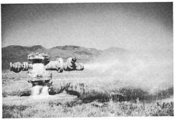
Steam well at Wabuska Hot Springs, Lyon County.

The American Sodium Co., using evaporating ponds, refined and shipped sodium sulfate from here in the 1930's. Davis and Ashizawa (1960) have suggested that a chemical company might be able to use hot water from wells to refine sodium sulfate. Samples of mixed sodium chloride and sodium sulfate from surface incrustations reportedly show