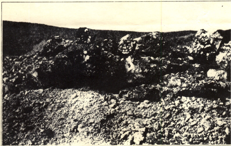
CONGLOMERATE ON DUMP.

A few words in regard to other proofs of past and present hydro-thermal activity in the surrounding country may be of service. The significance of the silicified zones which give ruggedness to the Wedekind neighborhood is problematical. These zones, which somewhat resemble quartzite, do not have a universal trend or strike, but outcrop in every direction. Unfortunately none of the work in the district has uncovered a contact between this rock and the gray andesite. Three miles to the northwest is an iron mine which is worked intermittently, producing ore containing about 50 per cent available FeO, and from one to three dollars per ton in gold and silver. Unmistakable marks of hot water prove