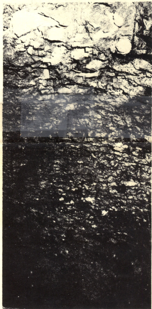
INCLINE FROM B.

In short, it seems that the facts, as found and stated, warrant the assertion that this ground has been the seat of hot spring activity similar to that so common in Nevada to-day, and that it owes its right to distinction principally to its connection with sources unusually rich in precious metals. The