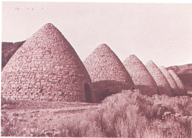
WARD CHARCOAL OVENS. Just a few minutes from downtown Ely are these historic remnants of the old mining days in the West. Ghost Towns of Ward & Taylor are nearby.