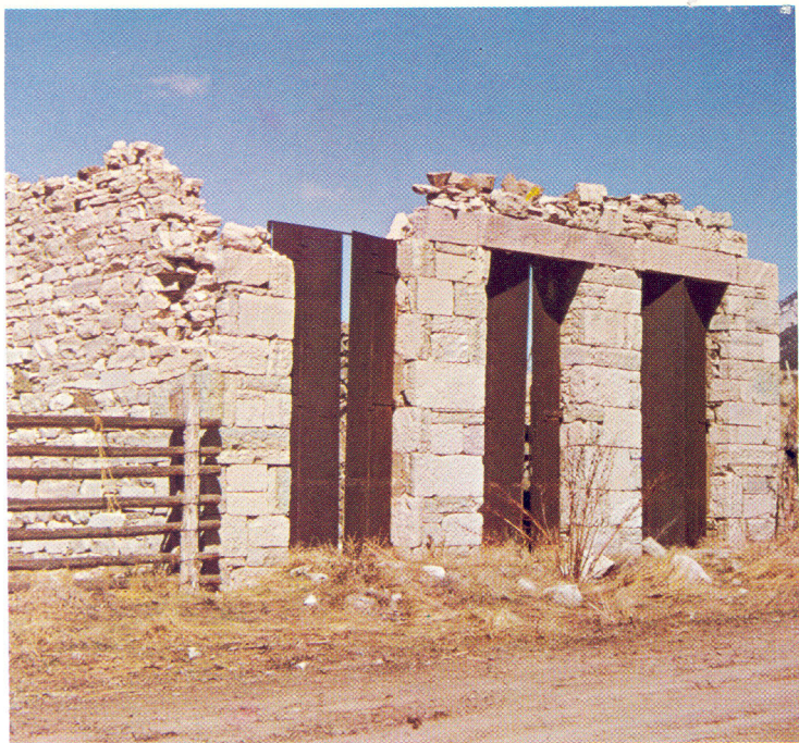
FORT SCHELLBOURNE remains as one of several reminders of the historic old west to natives and visitors alike. These crumbling ruins served first as a Pony Express station and later, as a fort for the U.S. Cavalry.