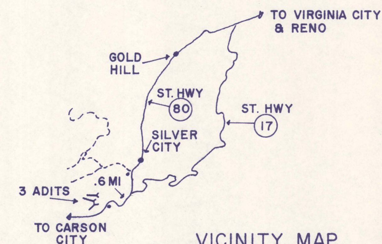
VICINITY MAP SCALE: 1" = 1 MILE