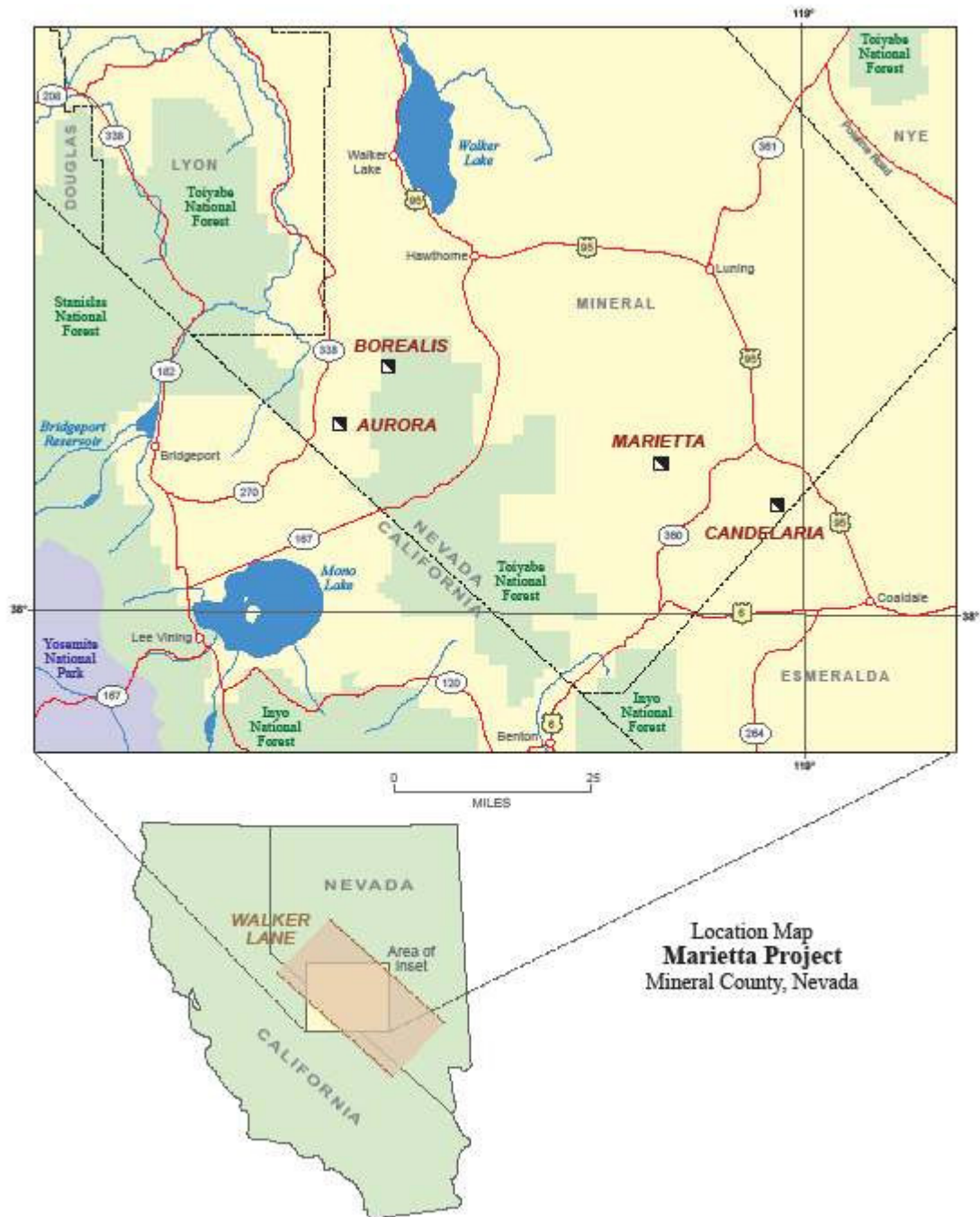
Figure 1. Project location within Nevada and the Walker Lane.